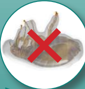
The cat flea ( Ctenocephalides ) Simulated images